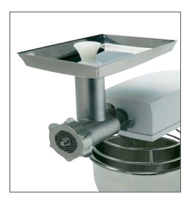
TEDDY with meat grinder, stainless steel.