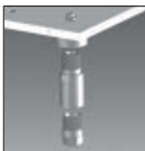
KITLEGSEXT000 Available as optional